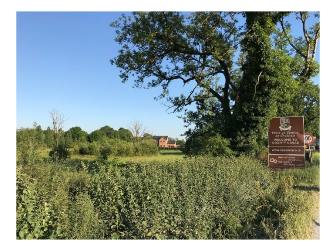
The border between Ireland and Northern Ireland

- Considers that some clarifications have to be brought to the British living in the European Union.