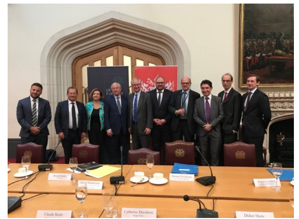
Work meeting with UK finance (London)

- Considers that the London located clearing houses should, in accordance with the European central Bank opinion, be transferred in the territory of the European Union.